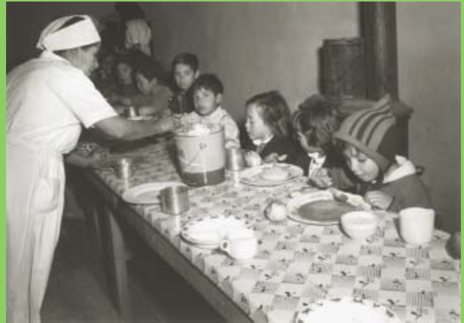
1941 School Lunch